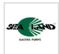
SEA LAND PRODUCTS