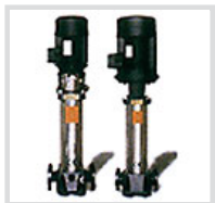
APCO CRX VERTICAL MULTISTAGE PUMP

Applications: Water supply for boilers, water treatment system, foodstuff and beverage industry, drainage and irrigation for high building, agriculture, garden and golf court, fire-fighting system, industrial clearing system, carrying, circulating and raising of liquid.