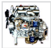
APCO YUKIKO DIESEL ENGINE

Applications: Water supply for boilers, water treatment system, foodstuff and beverage industry, drainage and irrigation for high building, agriculture, garden and golf court, fire-fighting system, industrial clearing system, carrying, circulating and raising of liquid.