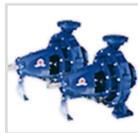
APCO NKX SINGLE STAGE CENTRIFUGAL PUMP

The 70,80,85,90 and 100 series high speed engines are manufactured by Yukik Power Co. The engine has the feature of compact structure, high reliability, easy start and convenient maintenance. It is ideal power source for water pump, small truck and generator sets. We have the special design engine for fire-fighting pump, exported to Middle East, South East, South East Asia, Europe, America and Australia.